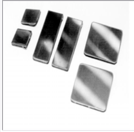
Figure 4. Electrodes: Mini Plates (1", 2", 1x3"), Point-Specific Probe, Transcranial Clip (Ear Clip), Auricular Probe