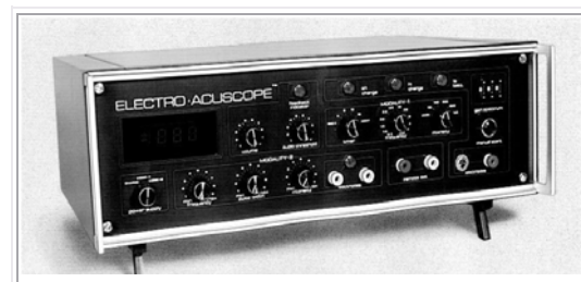
Figure 1. Electro-Acuscope Model 80C (circa 1991)

Biedebach (12) has argued that treatment efficacy is determined by certain microcurrent waveform parameters. Research suggests that N-type voltage-sensitive calcium channels in cell membranes are more effectively opened by short electrical pulses(13). Other work suggests that L-type voltage-sensitive calcium channels are more effectively opened by longer pulses (14). N-type channels tend to predominate on sensory neurons and stimulate the release of powerful vasodilating substances such as calcitonin gene-related peptide, whereas L-type channels predominate on fibroblasts (15). Theoretically, it would be advantageous for a microcurrent device to incorporate both characteristics into its waveform, and to adjust each component in response to changing tissue electrical impedance in an attempt to optimize the effect.